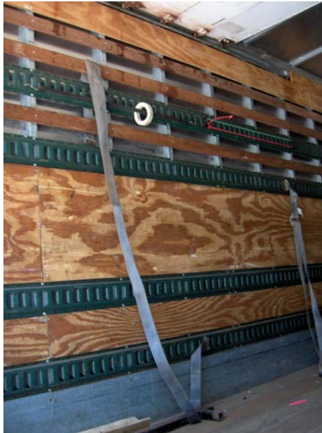
Inside Van Box